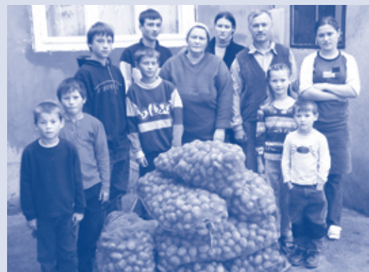
A gift of potatoes from the CSP