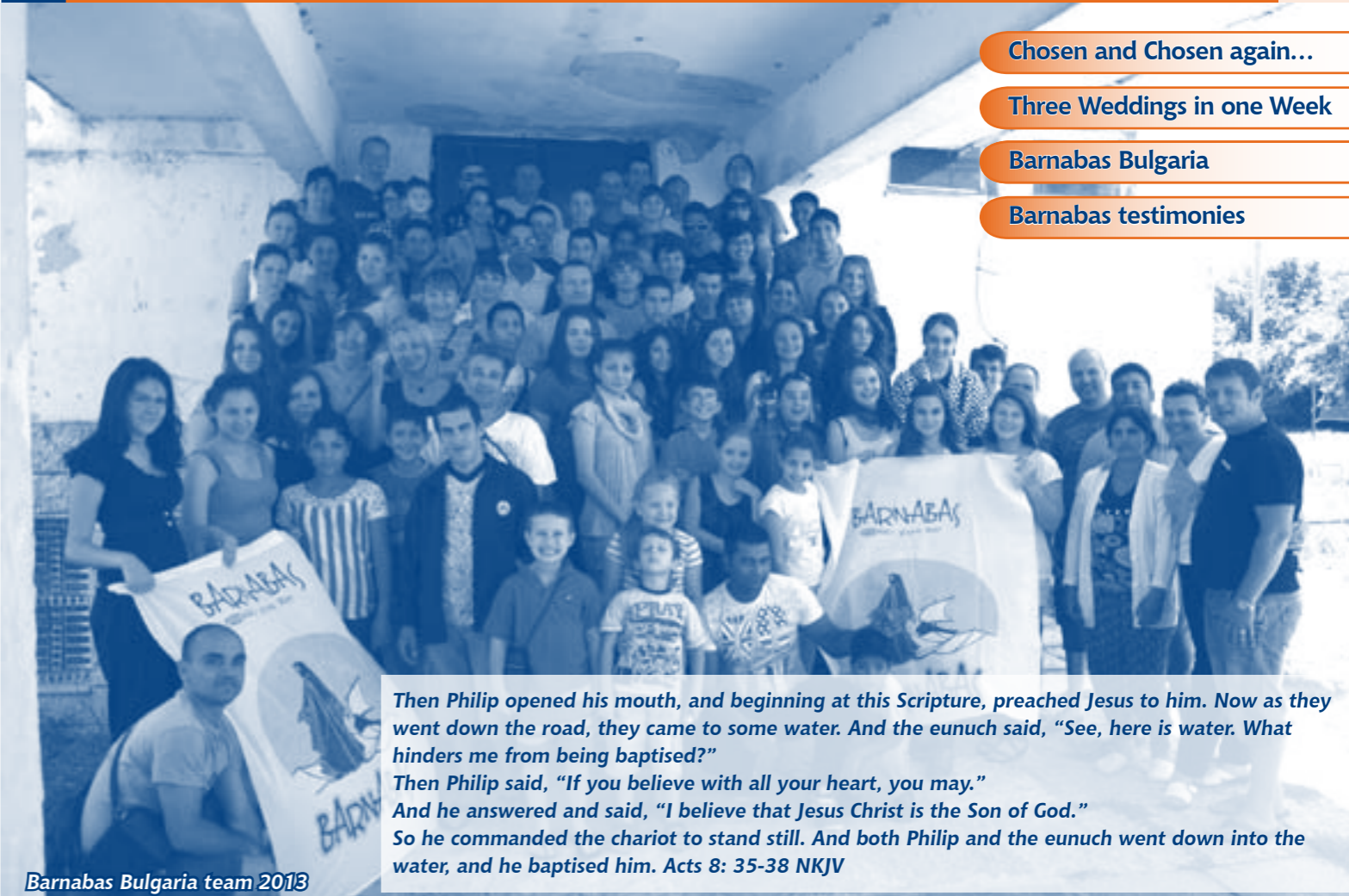
Barnabas Bulgaria team 2013

Then Philip opened his mouth, and beginning at this Scripture, preached Jesus to him. Now as they went down the road, they came to some water. And the eunuch said, "See, here is water. What hinders me from being baptised?"