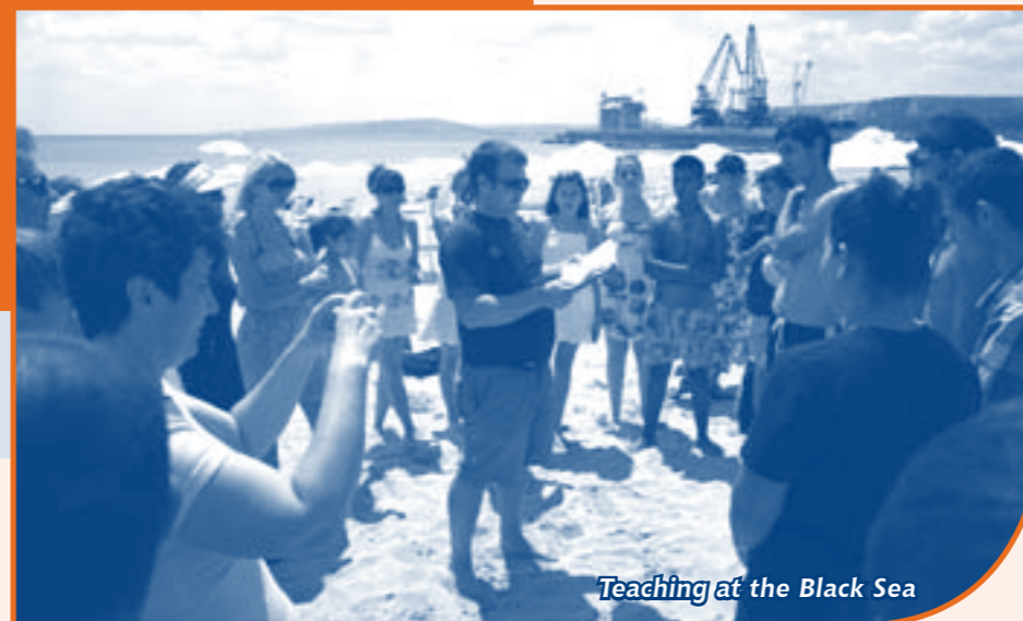
Teaching at the Black Sea

At the time of writing, Barnabas Bulgaria and Albania have just finished and Barnabas Romania is half way through. Over 250 young people have participated in the events. The following article is a report about the Bulgaria event and on the back page you will find testimonies from young people who participated in the Albania event.