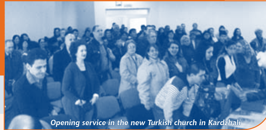
Opening service in the new Turkish church in Kardzhali

It is not politically correct to say anything negative against Islam, or to warn people of the consequences of this religion. However, it is a fact that this religion is gaining more and more ground in Europe. Bulgaria has for centuries been the physical and spiritual battleground as it is right on the border with Muslim Turkey and the Middle East and 'Christian' Europe. Even though all seems to be well in the EU country of Bulgaria, much is going on in the background. Last year we wrote in an article about a Bulgarian pastor who was nearly beaten to death by an angry mob from the local mosque. The battle still continues.