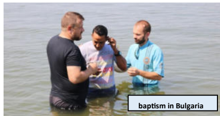
baptism in Bulgaria