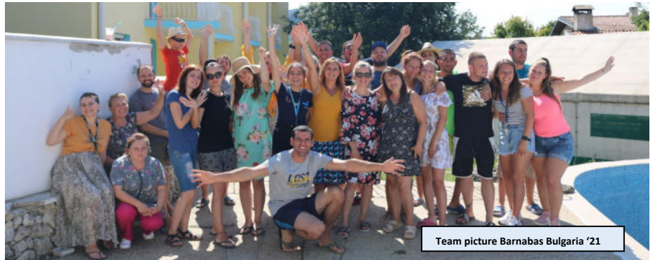
Team picture Barnabas Bulgaria '21

We started a closed group on Facebook for the church plant and invited the 53 people as well, so we can keep track of and support them. When we start the church they will be invited to join us. After the Sunday service, we had 2 people baptized in water.