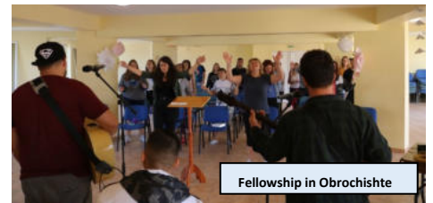
Fellowship in Obrochishte