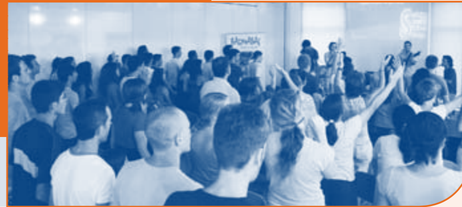
The sixth Barnabas Albania conference started in the city of Pogradec on the 15th July. Simultaneously, the first Barnabas Conference in Brussels started. The last conference this summer started at the beginning of August in Romania.

As usual, the forces of darkness tried to disturb the atmosphere and motivation of the participants. Where the team from Macedonia was delayed because of an inexplicable problem with one of the cars, the problems in Brussels were a lot bigger.